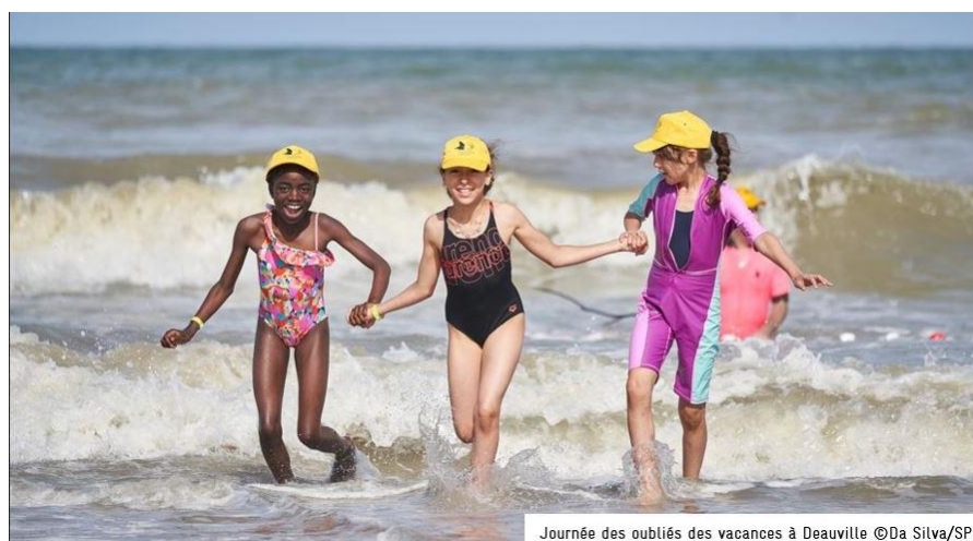
Journée des oubliés des vacances à Deauville

But the fun and enjoyable day also highlights an alarming reality: every year, 3 million children in France do not go on holiday. For many families, this basic right remains out of reach, hampered by poverty, inflation or successive crises. But holidays are not a luxury, they are a right: they play an essential role in children's development and balance. Recognised by French law in 1998 as a national objective and enshrined in the UN Convention on the Rights of the Child, the right to rest, play and escape should be guaranteed to all. The Secours populaire works to ensure that this right becomes a reality, not an exception.